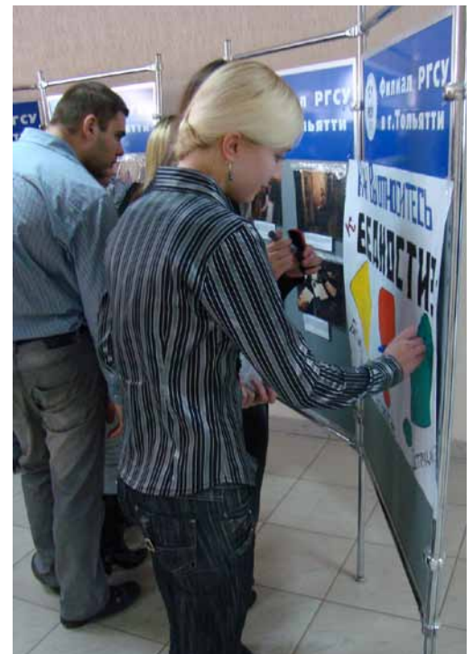
University quiz, 'Your attitude to poverty'

Longer-term benefits will come from sharing our experience with partners and like-minded people, increasing the quality and quantity of publications and the number of distributors among people without residence permits, and informing citizens about the problems of homelessness in Togliatti.